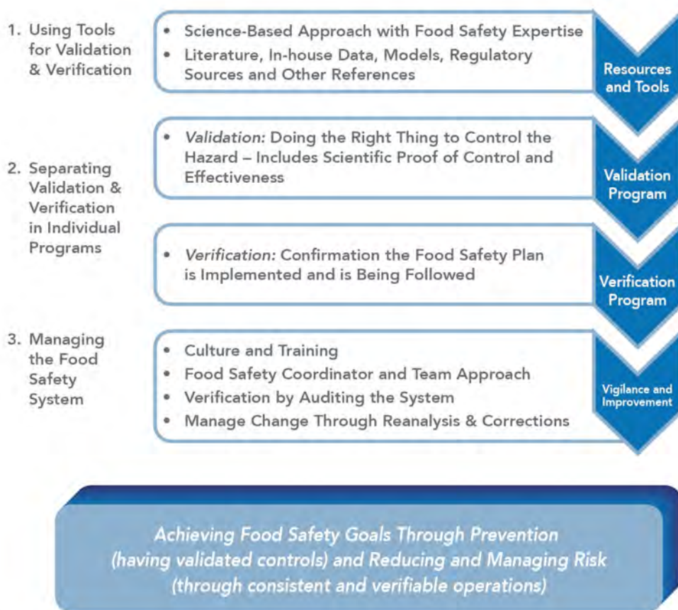
FIGURE 3. Framework for understanding and implementing FSMA validation and verification requirements

than 150 industry and academia participants that were captured in the Preventive Controls Summit 2013 during three breakout sessions. The framework focuses on the specific activities that are important to achieve FSMA food safety goals and to meet regulatory requirements. The approach presented here recommends: (1) use of science-based tools to construct effective controls for hazards, (2) consideration of validation and verification as separate programs, and (3) management of the food safety system with responsible and qualified staff who can recognize and adapt when change is needed.