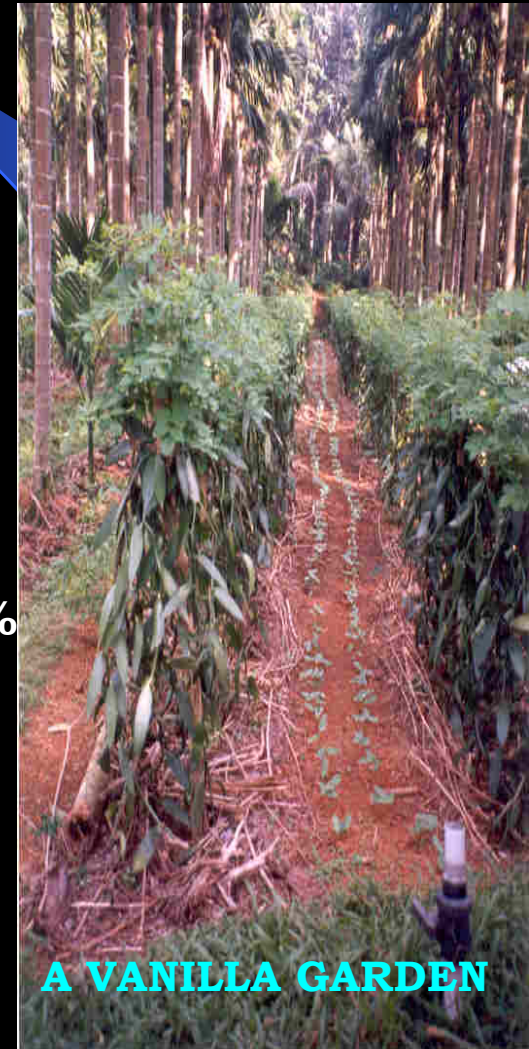
A VANILLA GARDEN

FLAVOUR COMPARABLE WITH THE BEST OF BOURBON